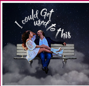
I Could Get Used To This (ICGUTT) (2021)