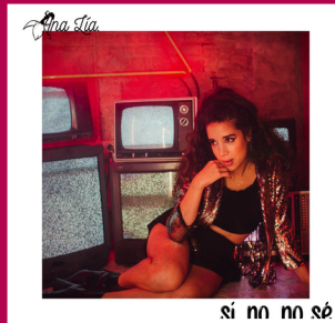
Sí. No. No sé. (2022)