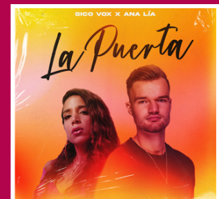
La Puerta - Sico Vox (2021)